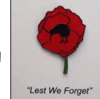
"Lest We Forget"