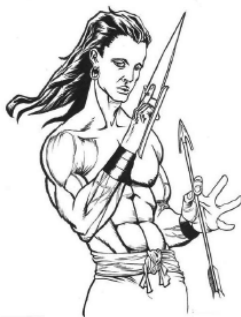
Rama – Illustration by Sarwat Chadda

There were huge celebrations when Rama and Sita returned to the kingdom. Everyone placed a light in their windows and doorways to show that the light of truth and goodness had defeated the darkness of evil and trickery.