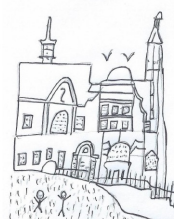
Home School Agreement