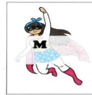
Motivating Melinda Be keen to succeed; try your best.