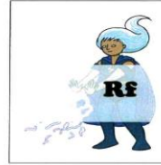
Reflecting Roxy Learn from experience; build on your learning.