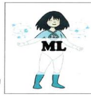
Making Links Mollie Make connections across all areas of your learning.