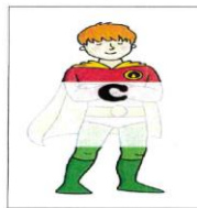
Collaborating Carlos Work well together; support each other.